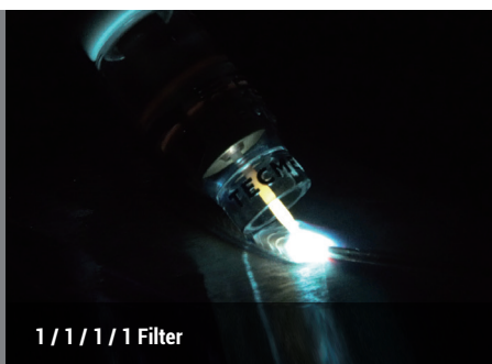
1 / 1 / 1 / 1 Filter

During welding, it helps user to observe the weld pool and weld seam more easily and finish welding job more accurately.