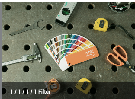
1 / 1 / 1 / 1 Filter

Before/after welding, restore true color, providing extra clear view with comfortable feeling. Easy to adjust the welding machine settings without flipping the helmet.